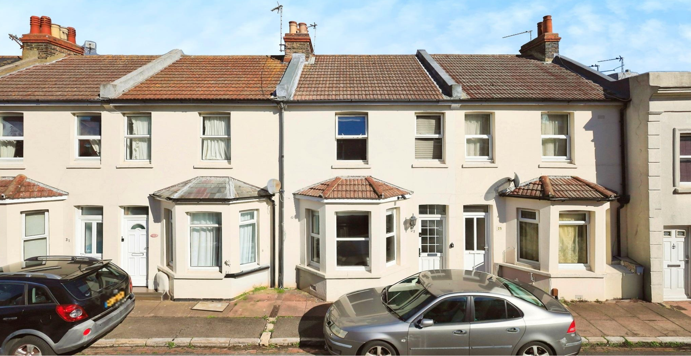
Leslie Street, Eastbourne BN22 8JB