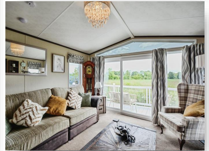
Wainfleet Bank, Wainfleet Skegness PE24 4ND