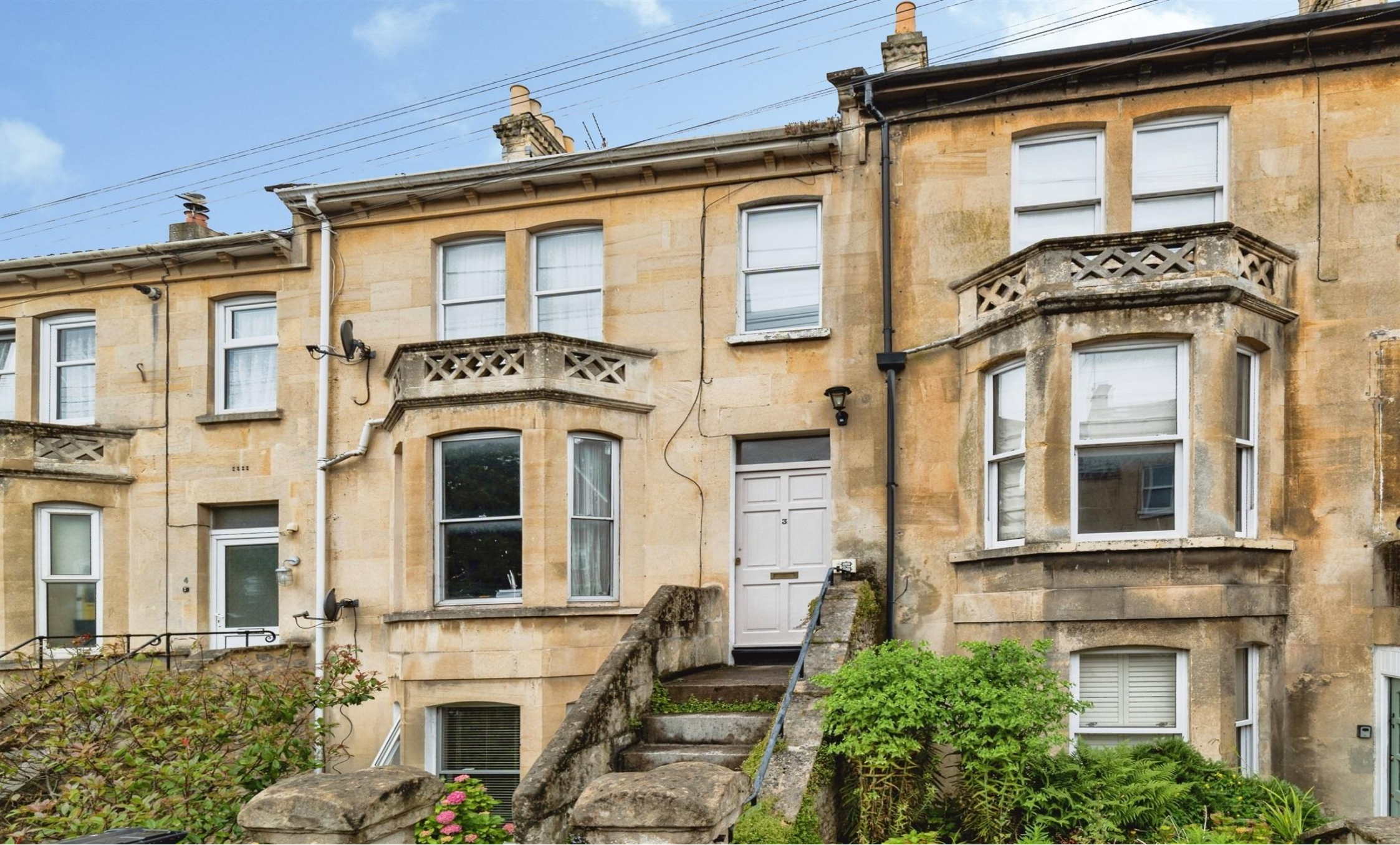
Station Road, Lower Weston Bath BA1 3DX