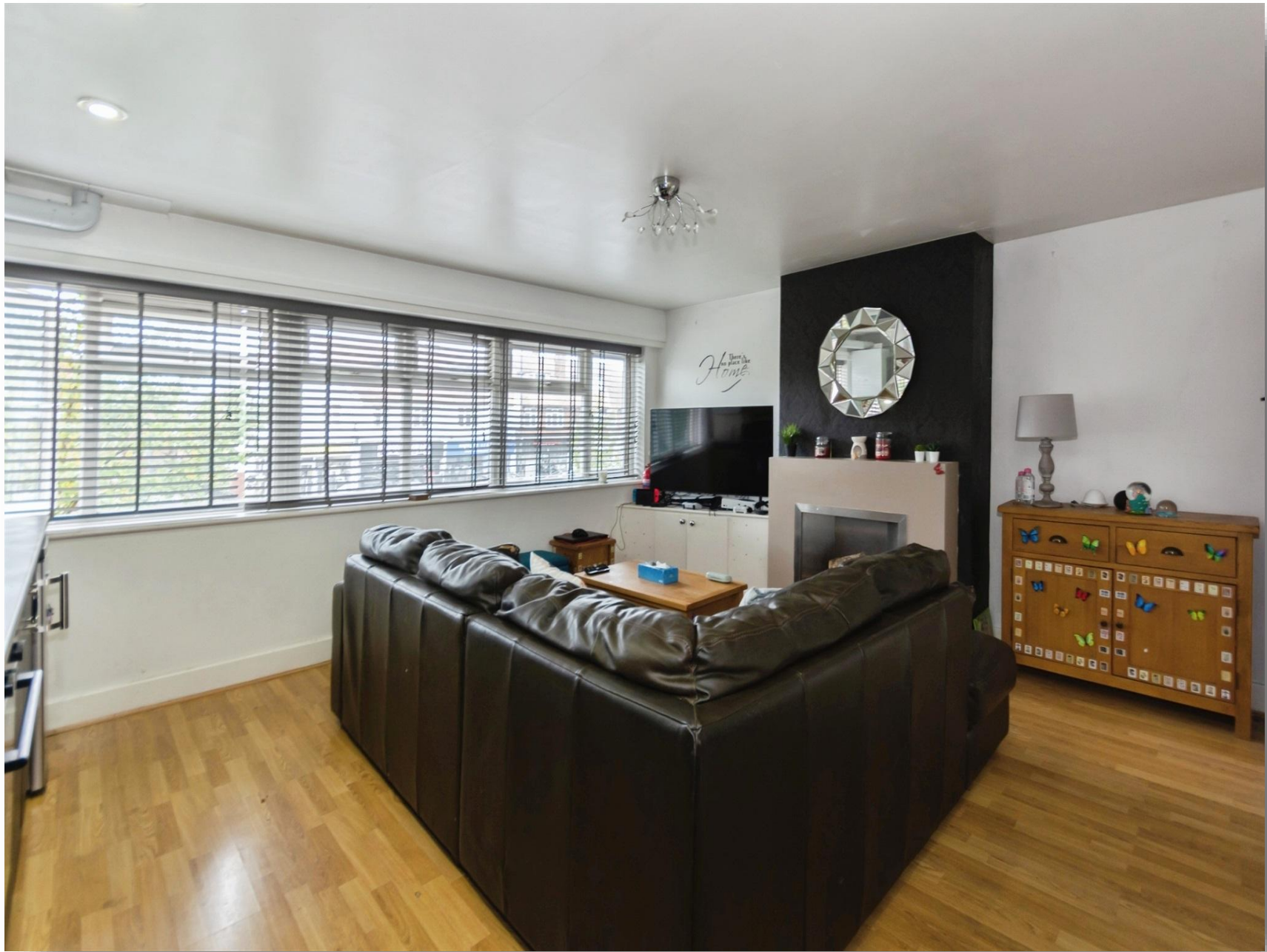
Stratford Road, Shirley Solihull B90 3AY