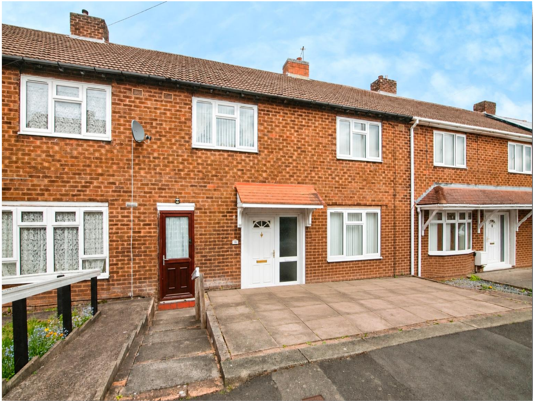
Pine Green, Dudley DY1 3RB