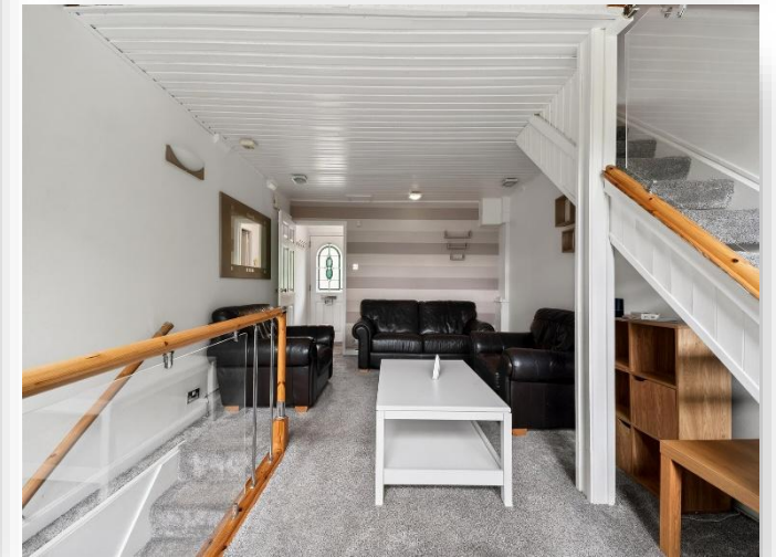
Kingsburn Grove, Rutherglen Glasgow G73 2DP