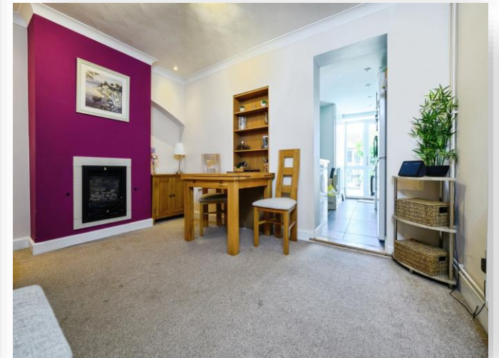
Norman Road, Gosport, PO12 3NA