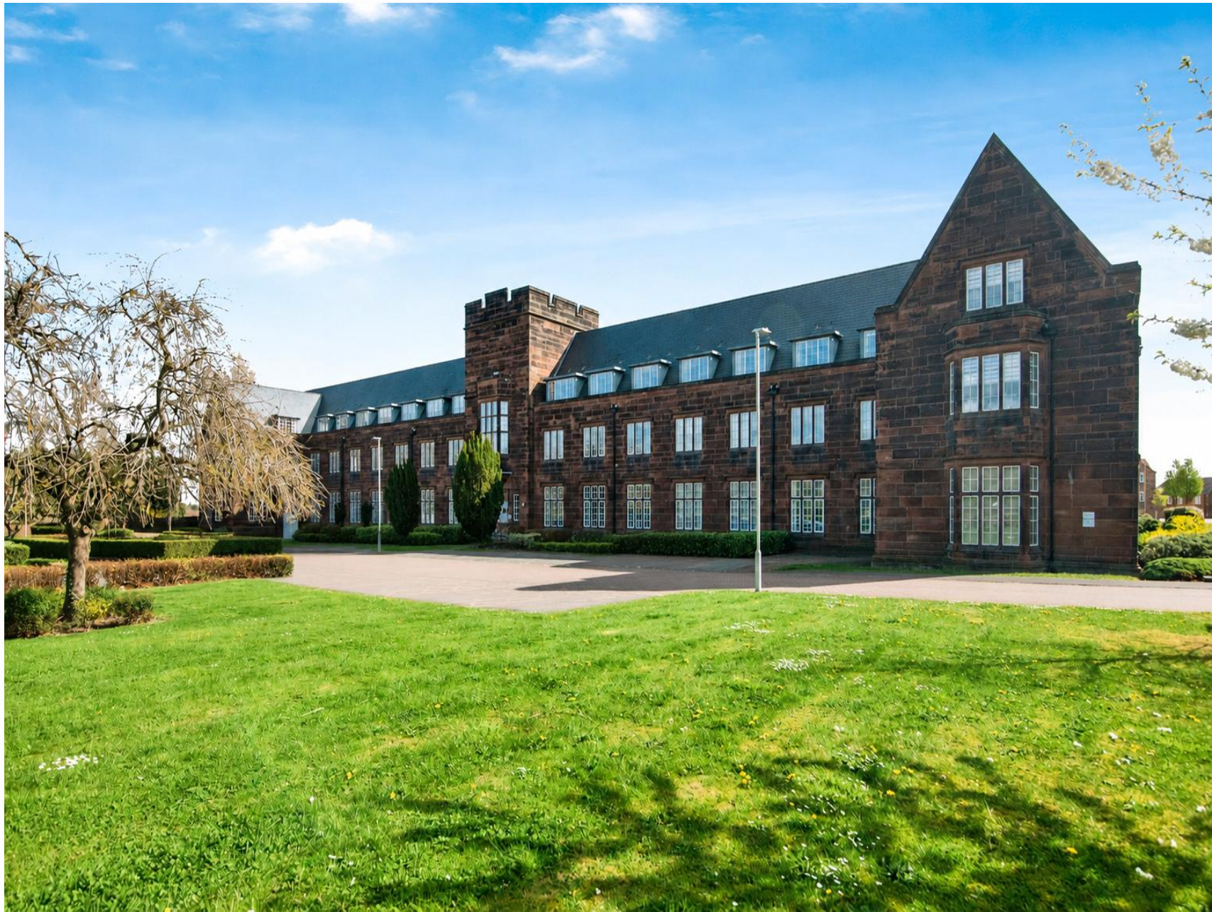
Bourne Hall Mallow Grove, DUDLEY DY1 4SU