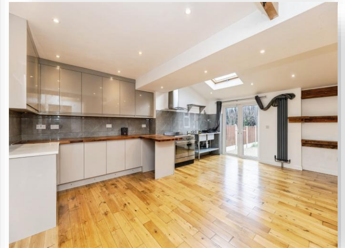
Dewsbury Road, Tingley WAKEFIELD WF3 1LN