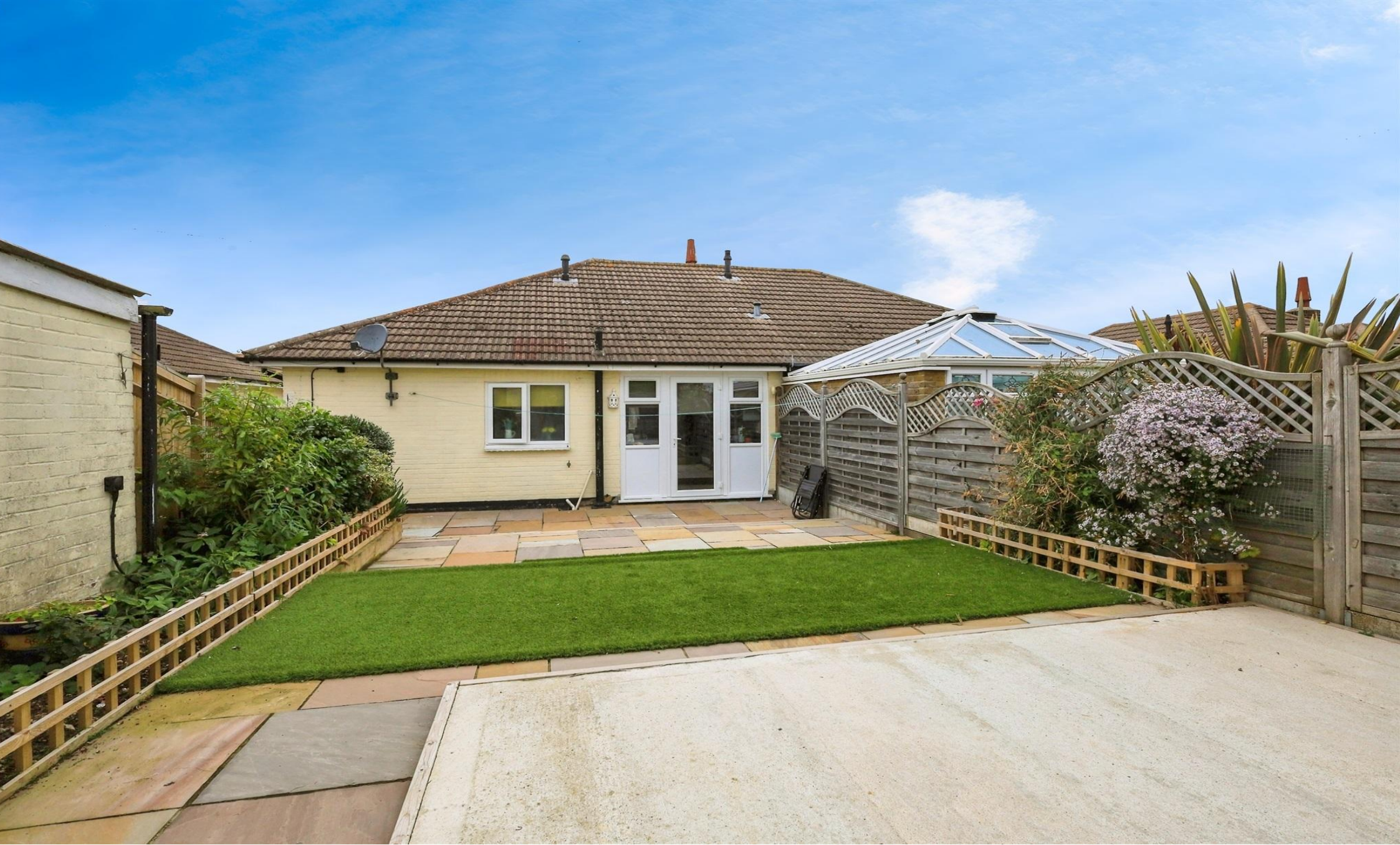
The Hydney, Eastbourne BN22 9BY