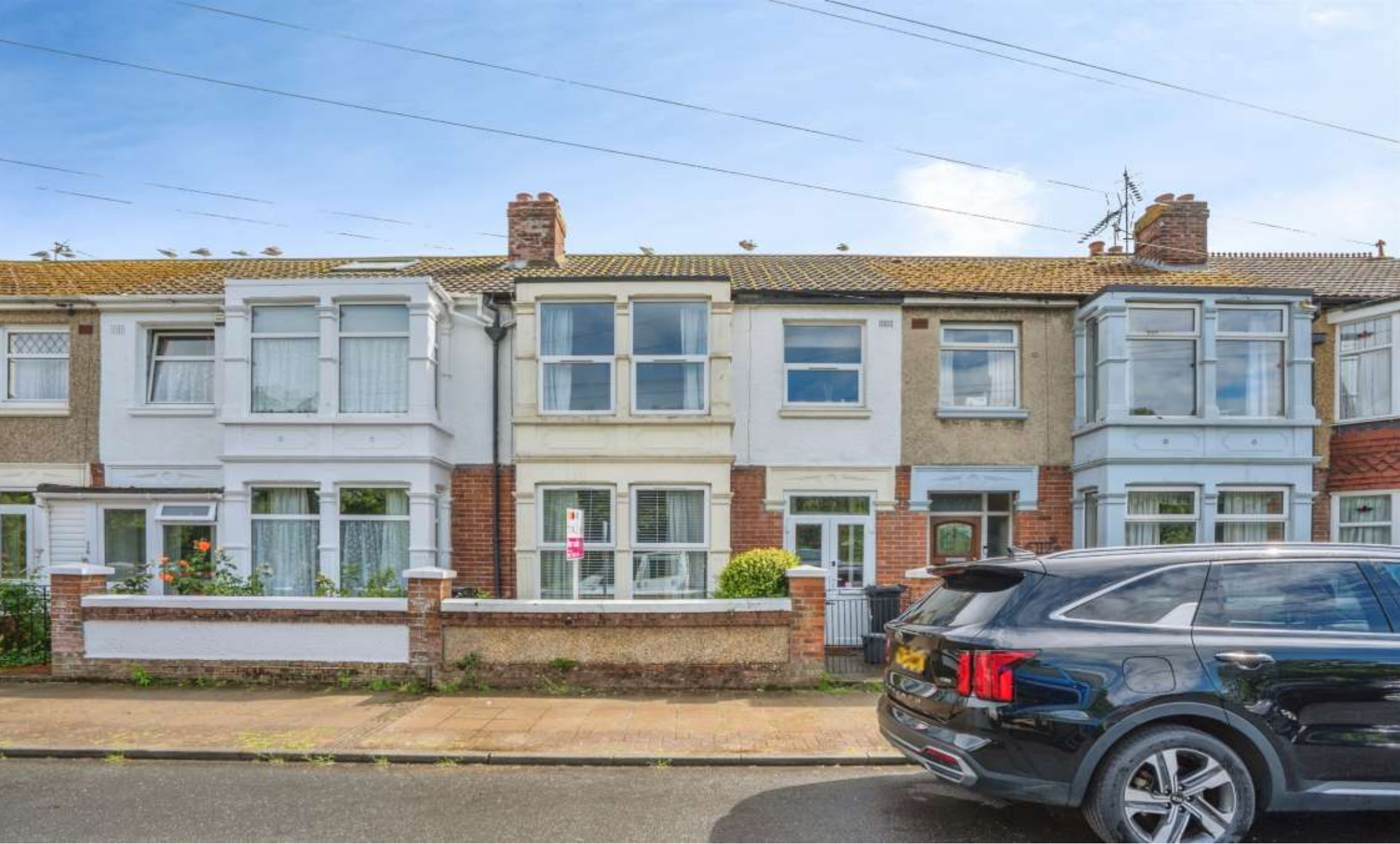
Hayling Avenue, Portsmouth PO3 6ED