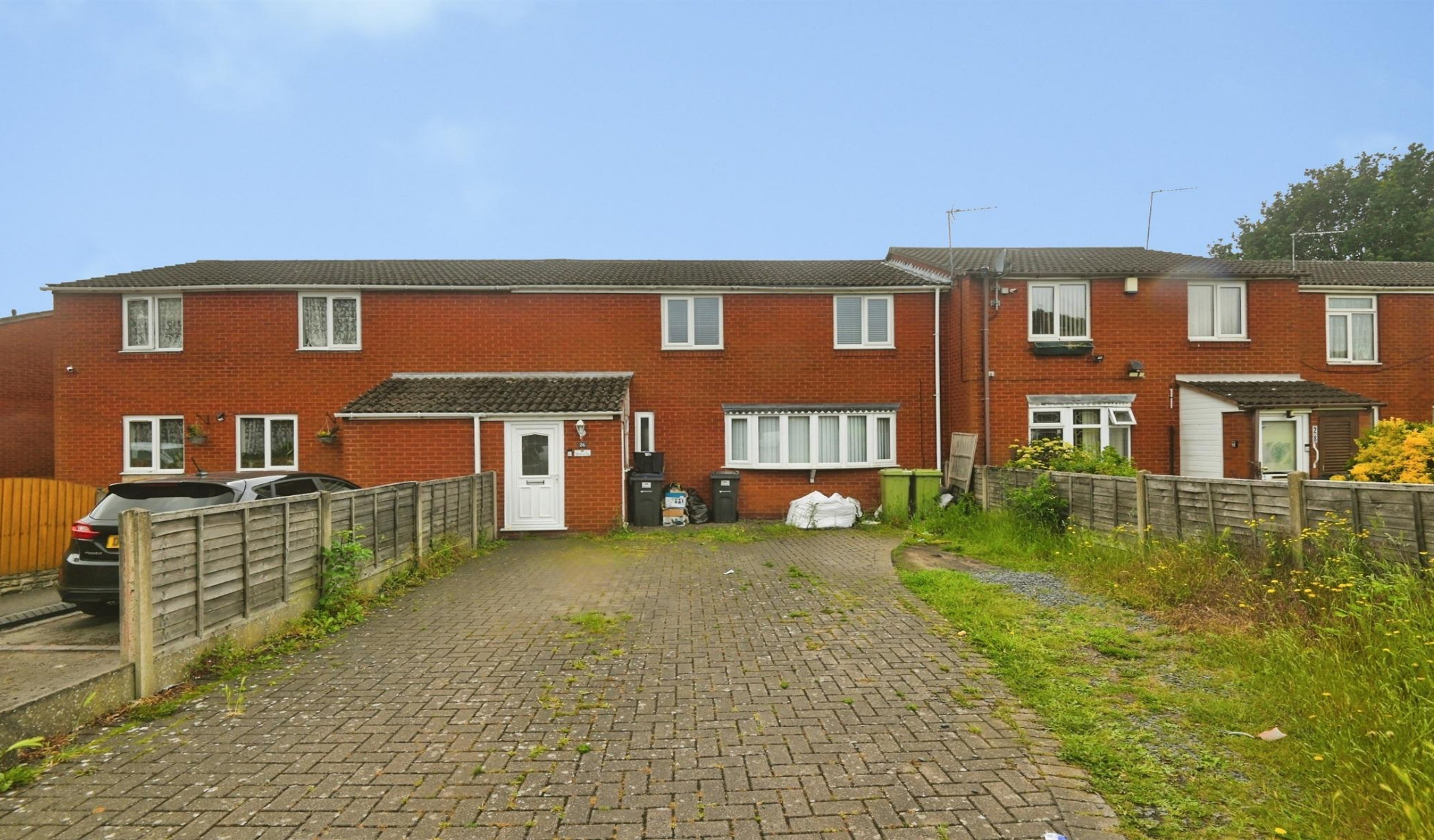
Barlands Croft, Birmingham B34 6TZ