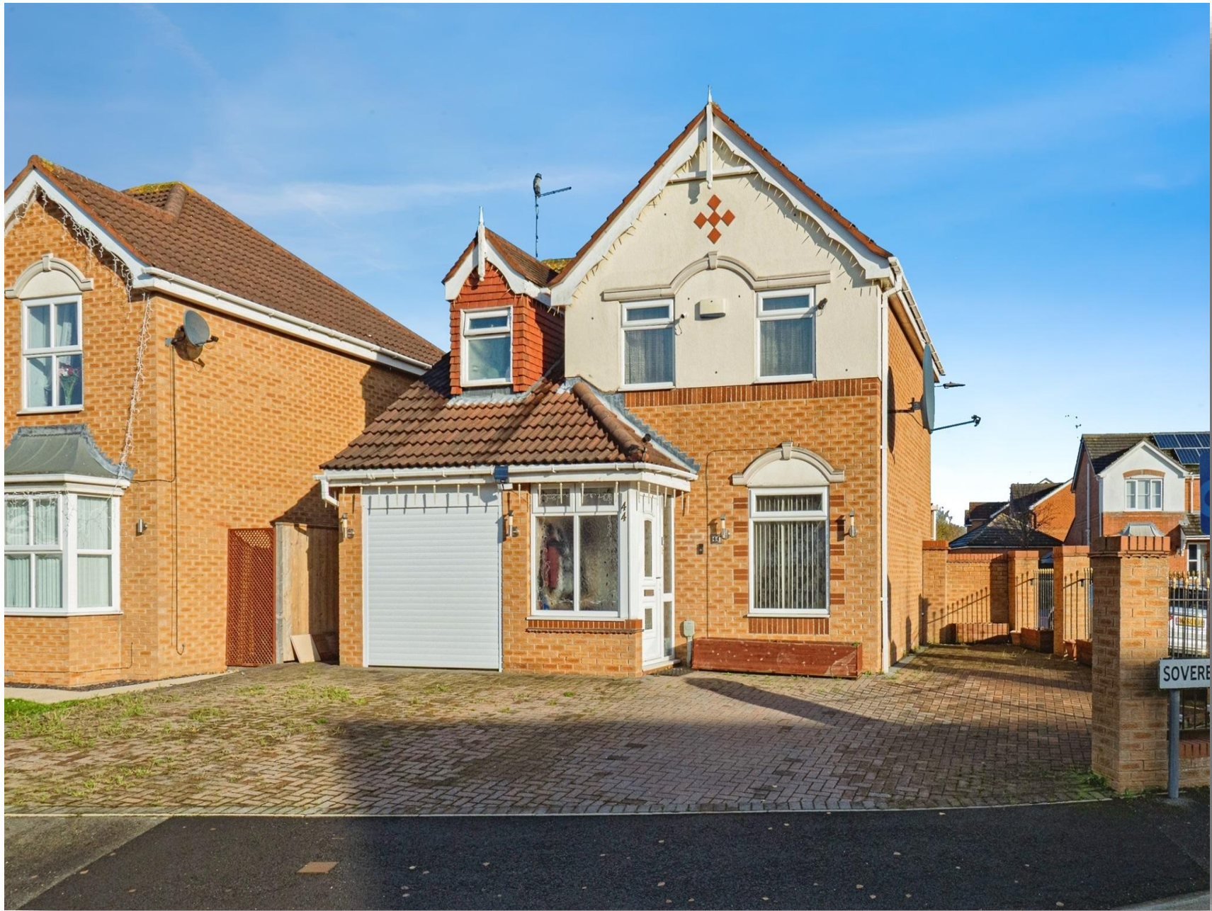
Sovereign Way, Kingswood, Hull, HU7 3JG