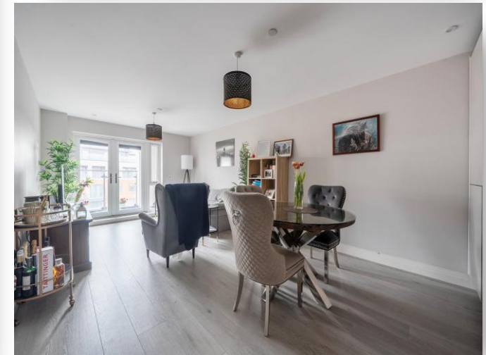
Apartment 76 Waterside Court, The Colonnade, Maidenhead SL6 1DL