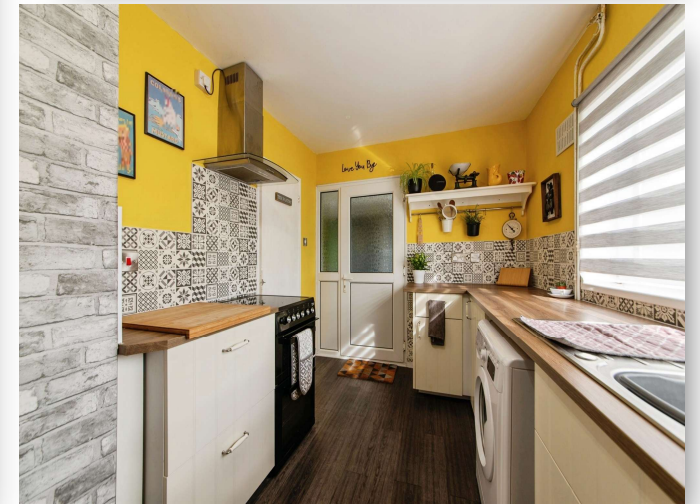
Newfield Drive, North Kyme Lincoln LN4 4DN