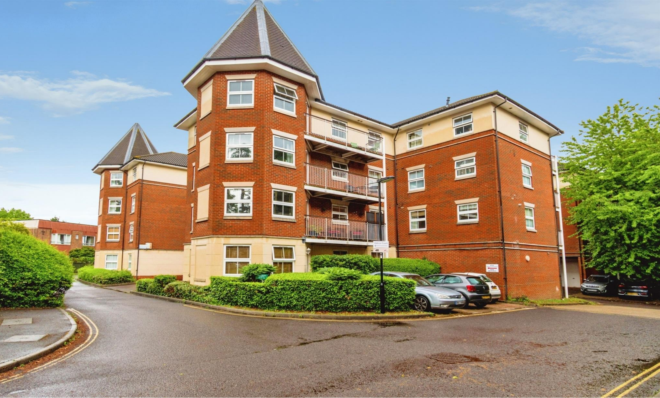
Rollesbrook Gardens, SOUTHAMPTON SO15 5WB