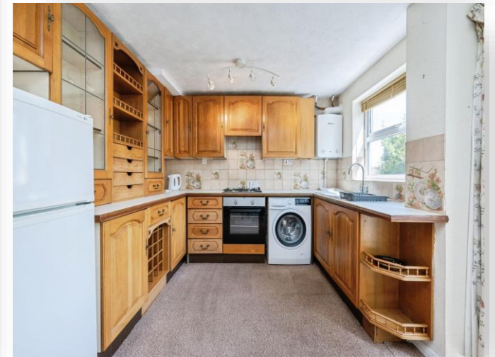
Mercury Way, Leighton Buzzard, LU7 3UZ