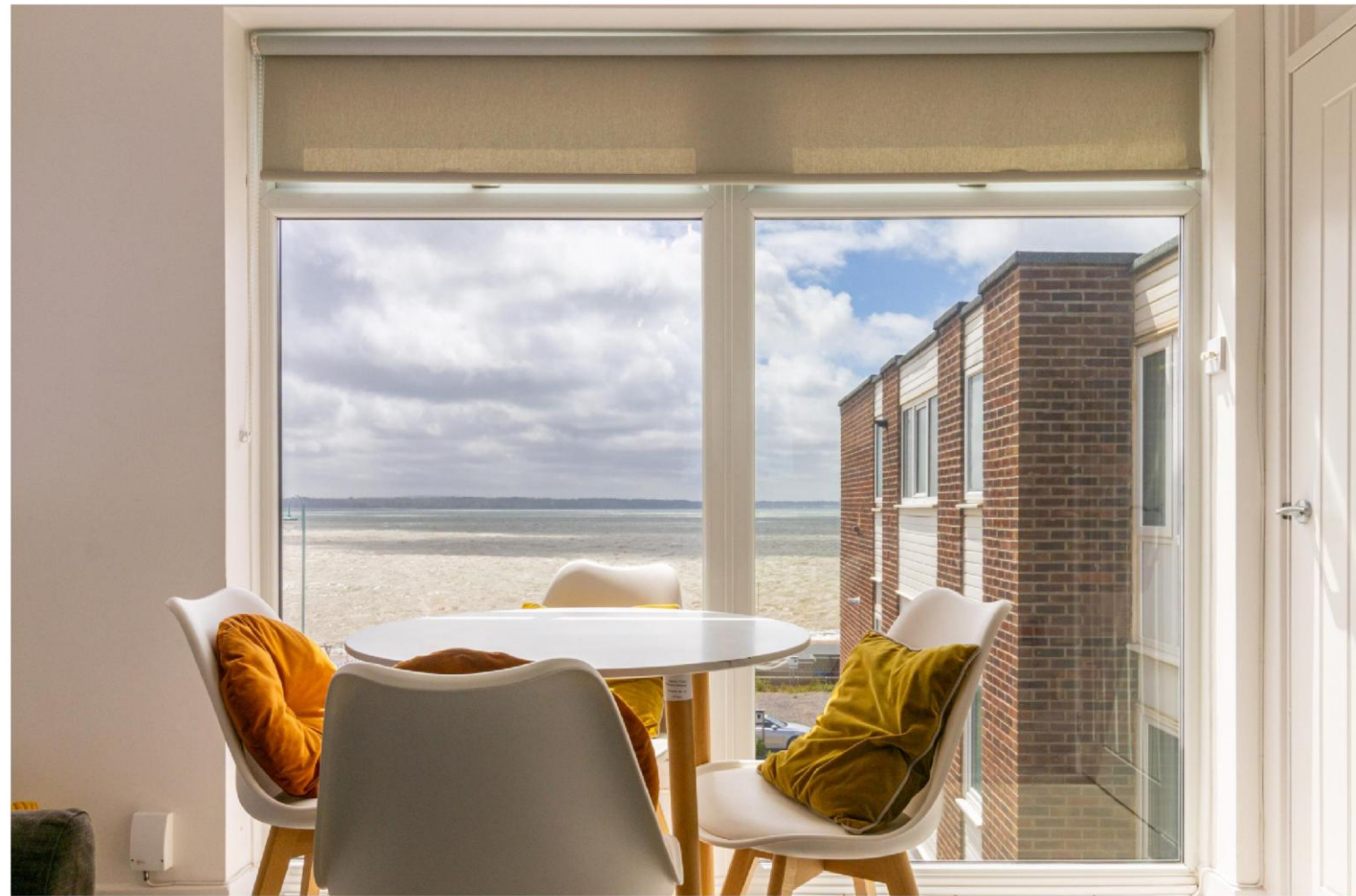
At home in Lee-on-the-Solent