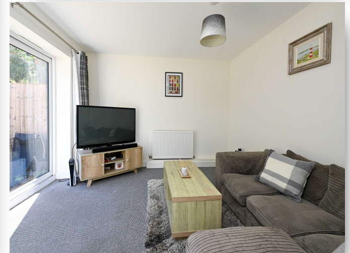
Old Mill Close, Whittington, KING'S LYNN, PE33 9TR