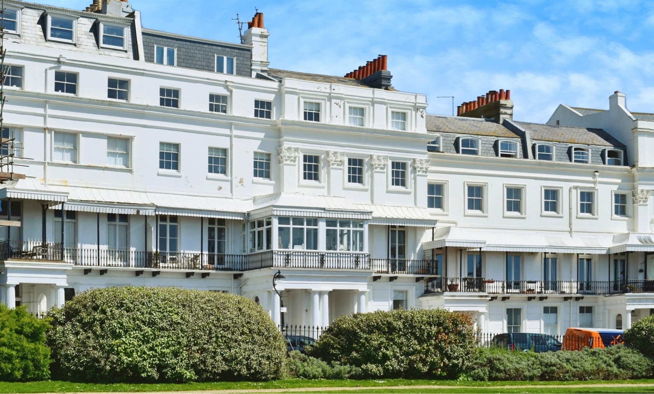
Lewes Crescent, Brighton, BN2 1GB