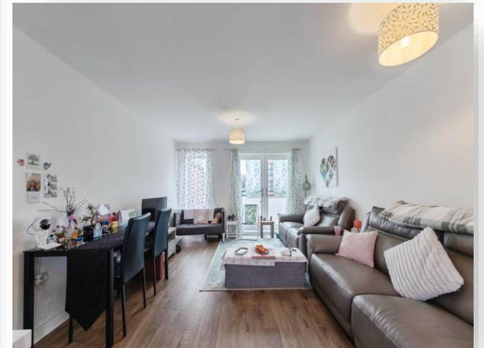
Woodview Rise, Blythe Valley Park Shirley B90 8DQ