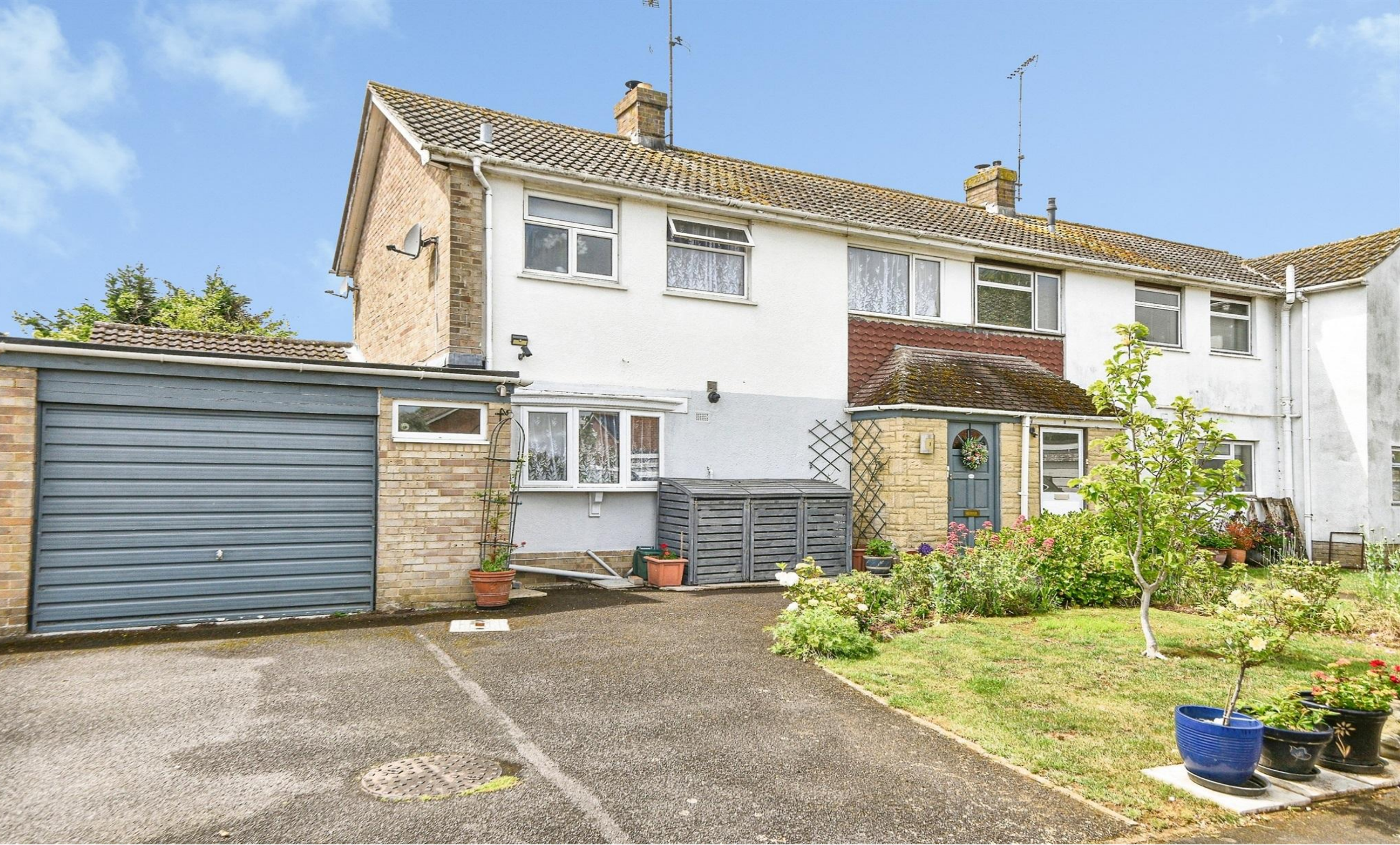
Cowleaze Close, Shrivenham Swindon SN6 8EH