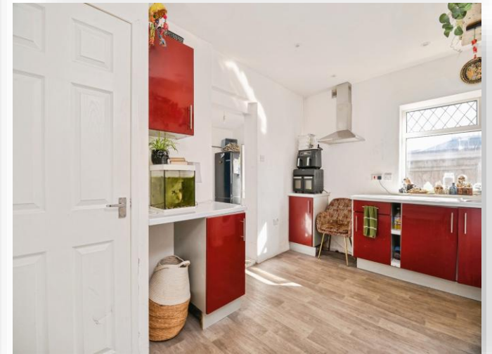
Eastcroft Road, Middlesbrough TS6 7ET