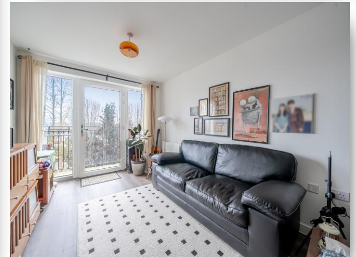
Bowdown House Clivemont Road, Maidenhead SL6 7DF