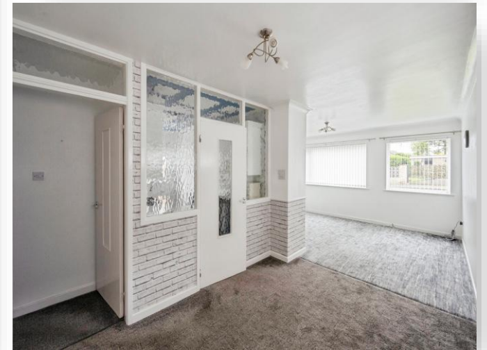
Sandown Road, Mexborough S64 0BL