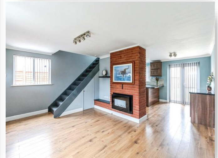
Popham Close, Raunds NN9 6SP