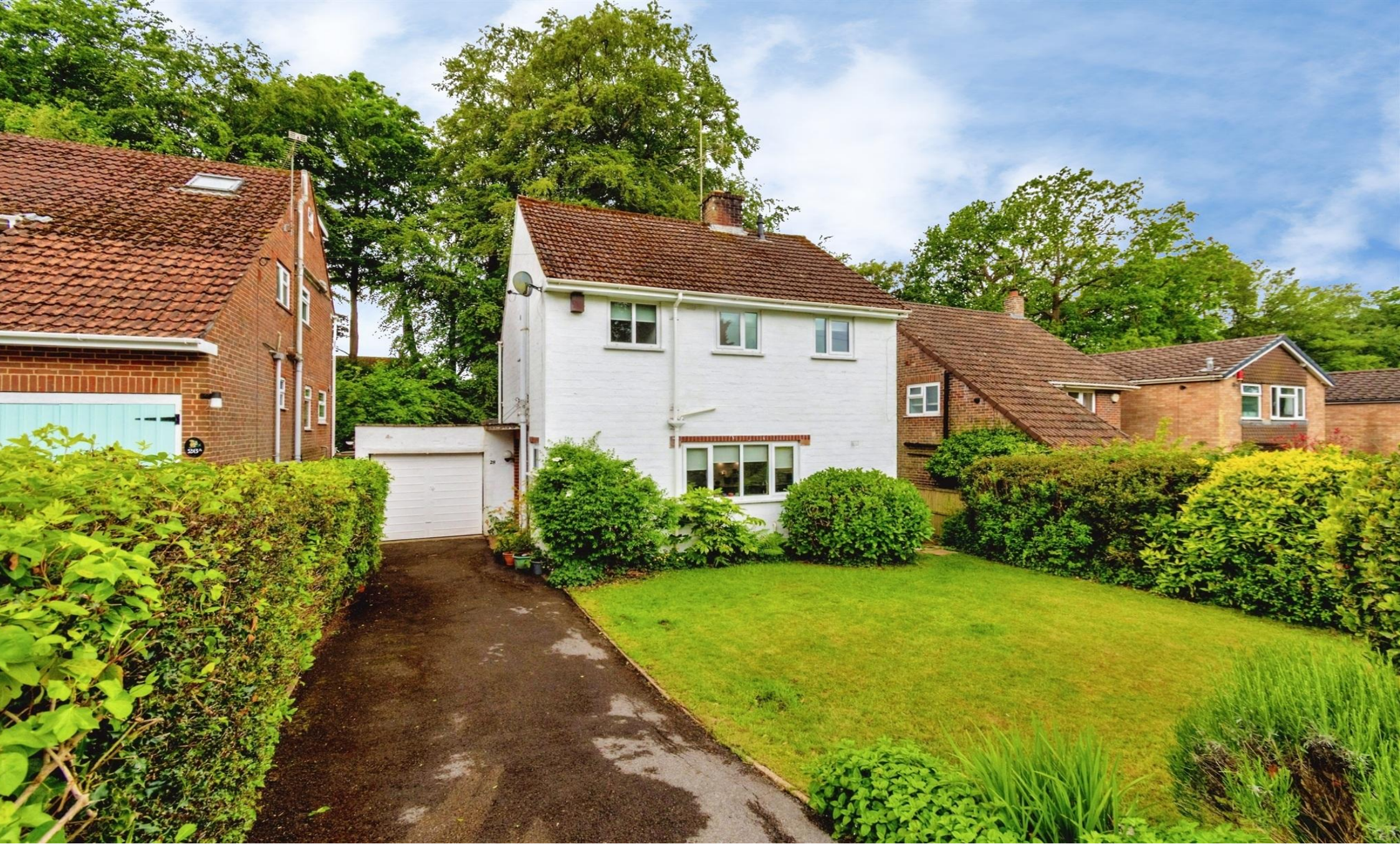
Bassett Row, Southampton SO16 7FS