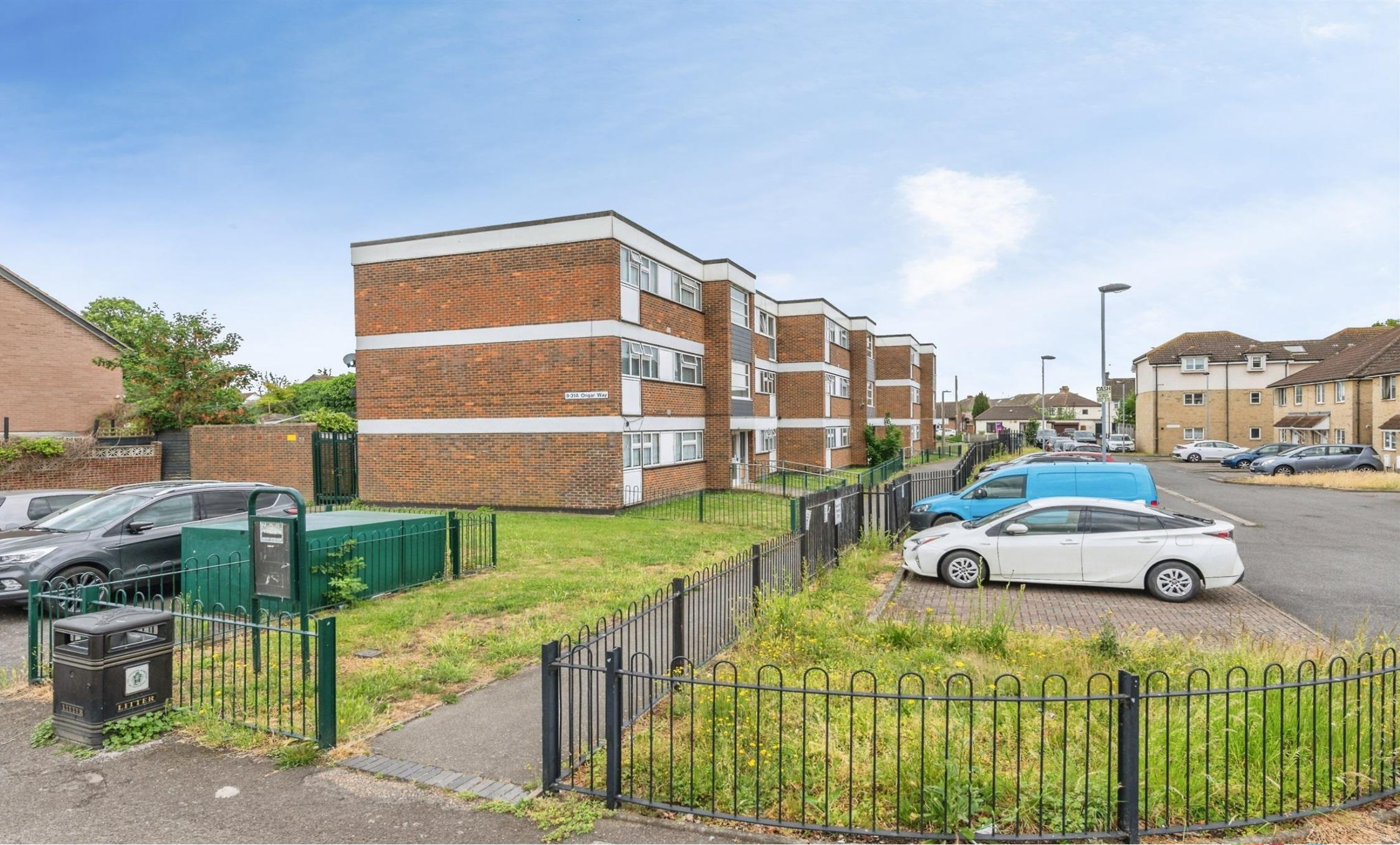
Ongar Way, RAINHAM, RM13 7TS