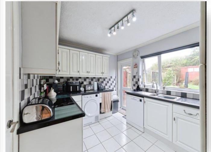
Arlington Road, Birmingham B14 4QB