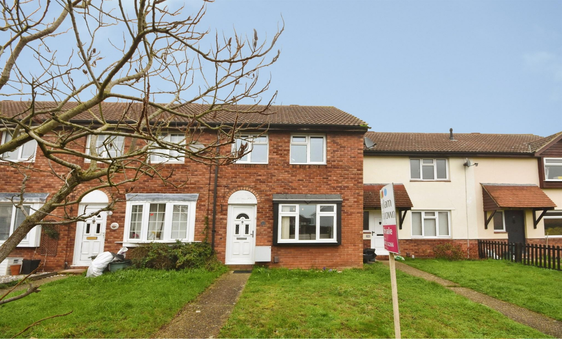
Wilkinsons Mead, Chelmer Village Chelmsford CM2 6QF