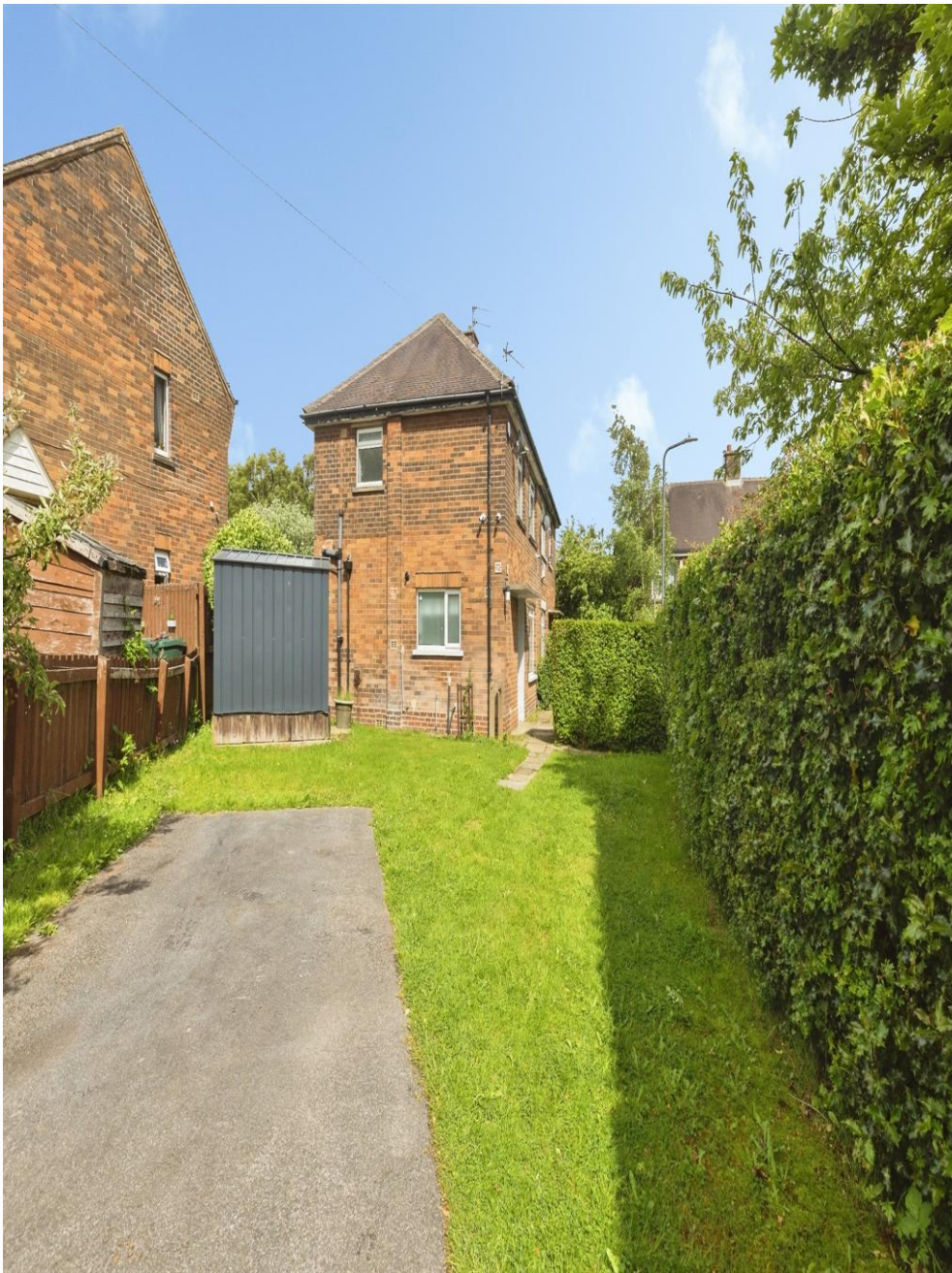
Eaglesfield Drive, Bradford BD6 2PY