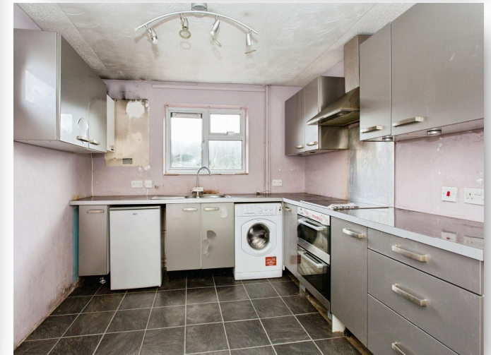
41 Highwood Crescent, Gazeley, Newmarket, CB8 8RU