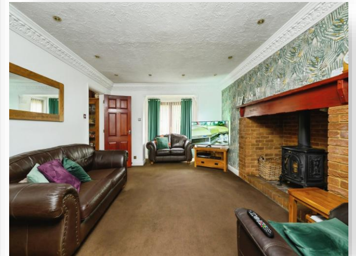
Crowland Road, Eye Peterborough PE6 7TR