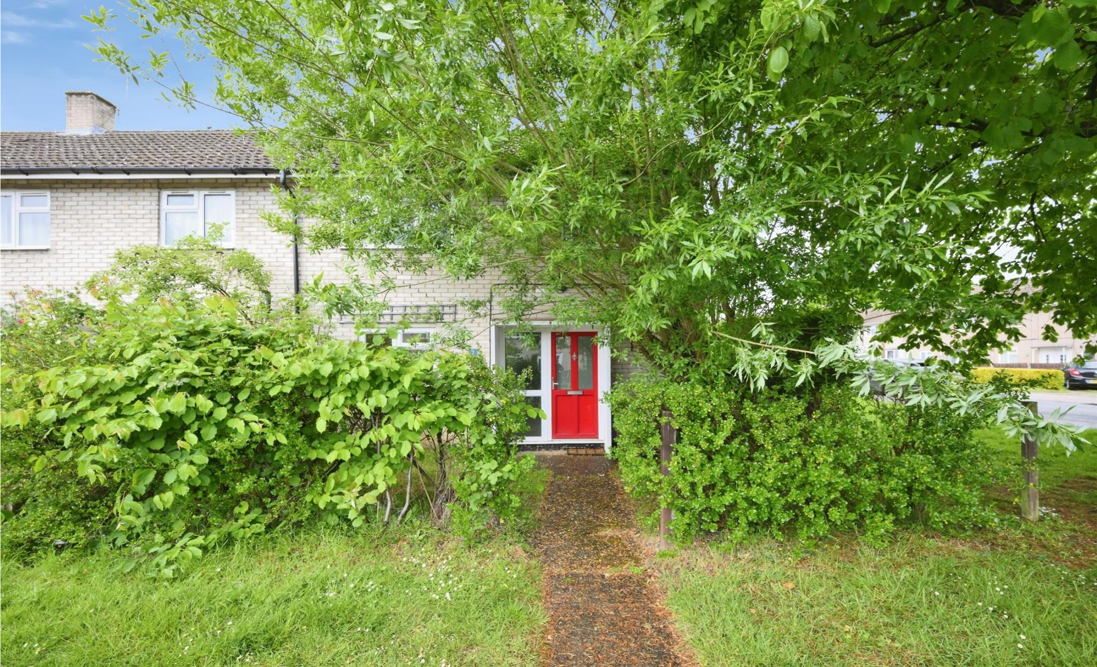
Green Acres, Welwyn Garden City AL7 4LJ