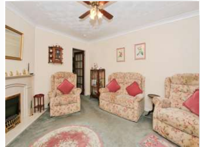
Hawthorn Road, Yaxley Peterborough PE7 3JP