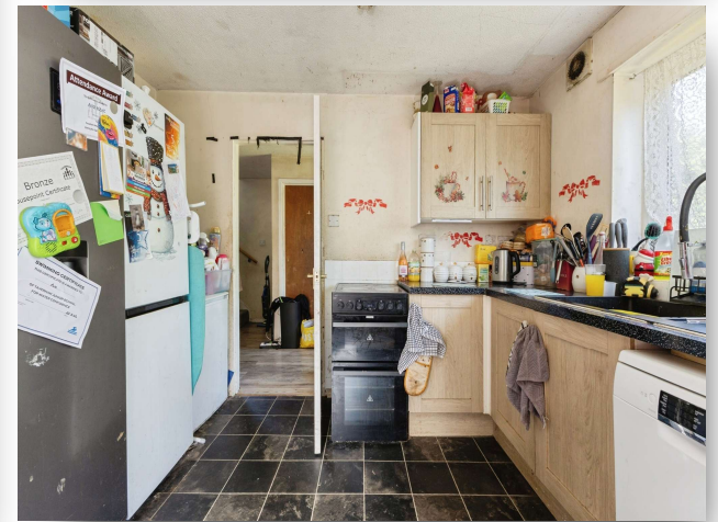
Nightingale Drive, Taverham Norwich NR8 6TR