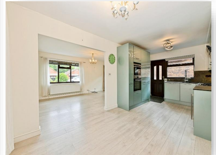
Haven Close, West Bridgford Nottingham NG2 7LP