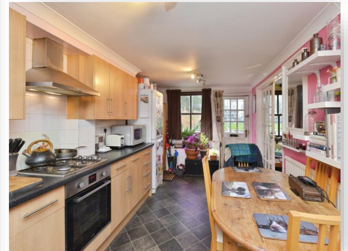
Tickford Street, Newport Pagnell, MK16 9AW