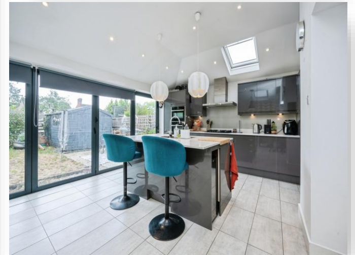
Northcourt, Leighton Buzzard, LU7 3DJ