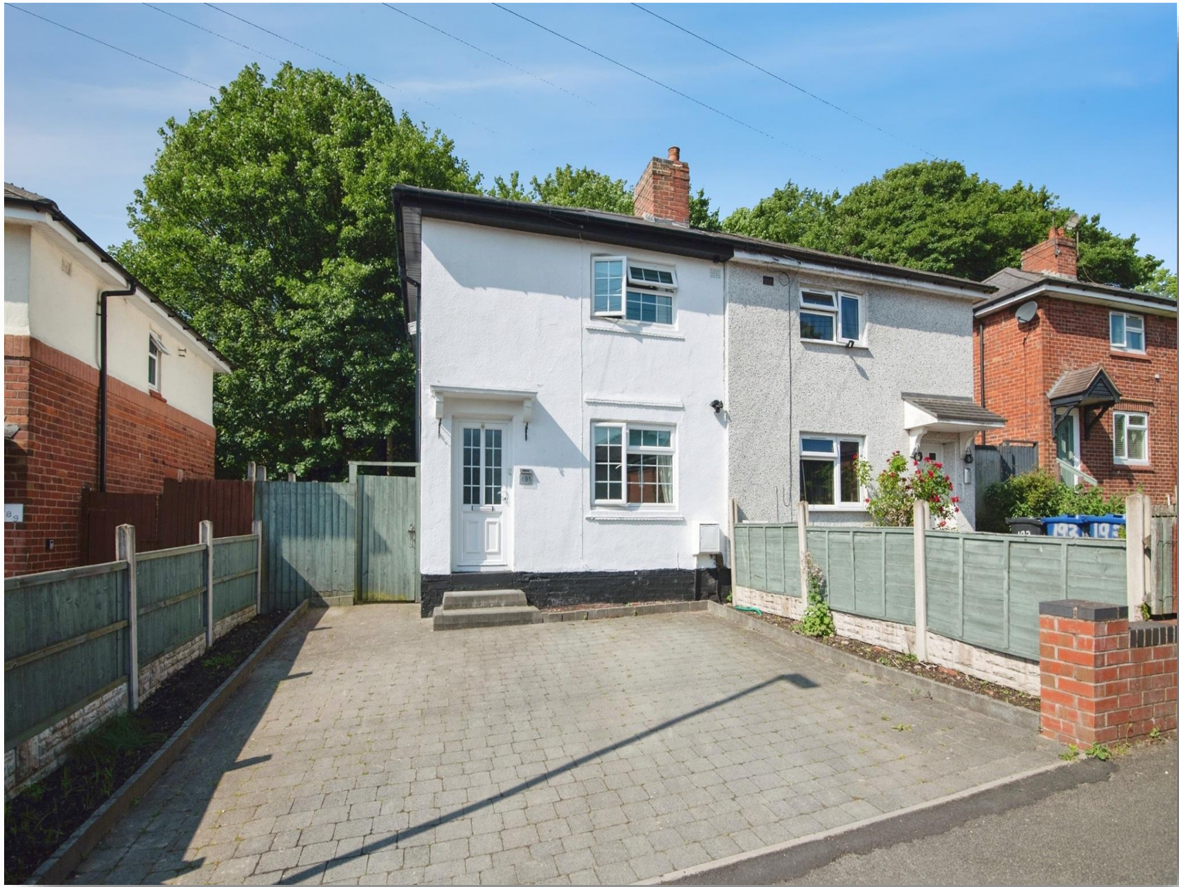
Green Park Road, Dudley DY2 7LZ