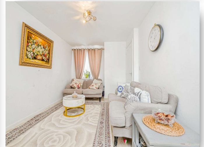
Eastside Quarter Maelfa, Llanedeyrn Cardiff CF23 9PN