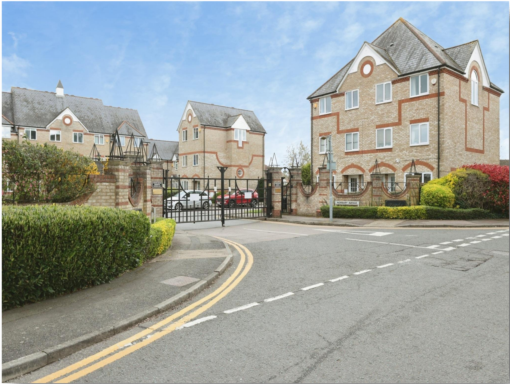
Norbury Avenue, Watford, WD24 4PD