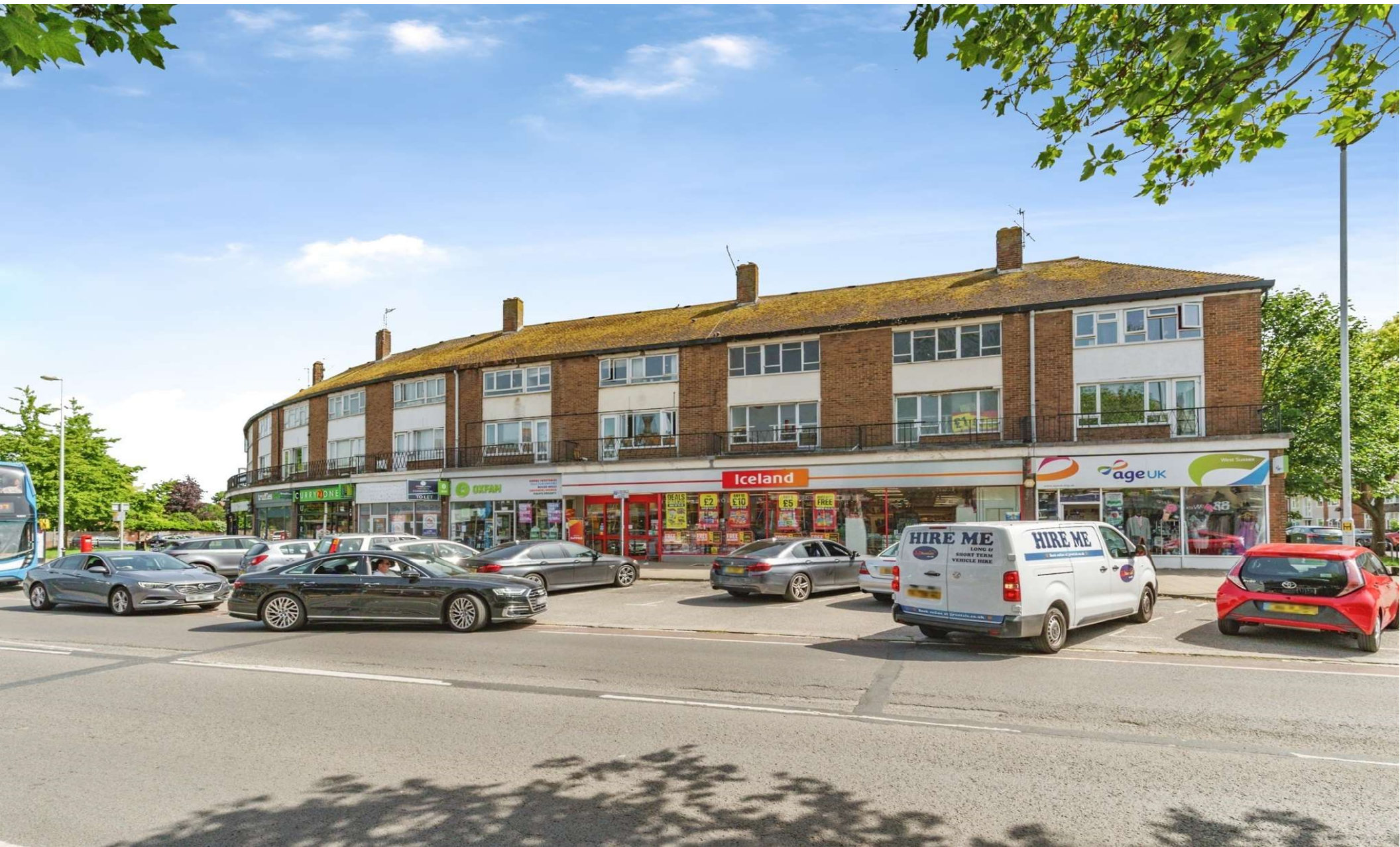
Wallace Parade, Goring-by-Sea WORTHING BN12 4AL