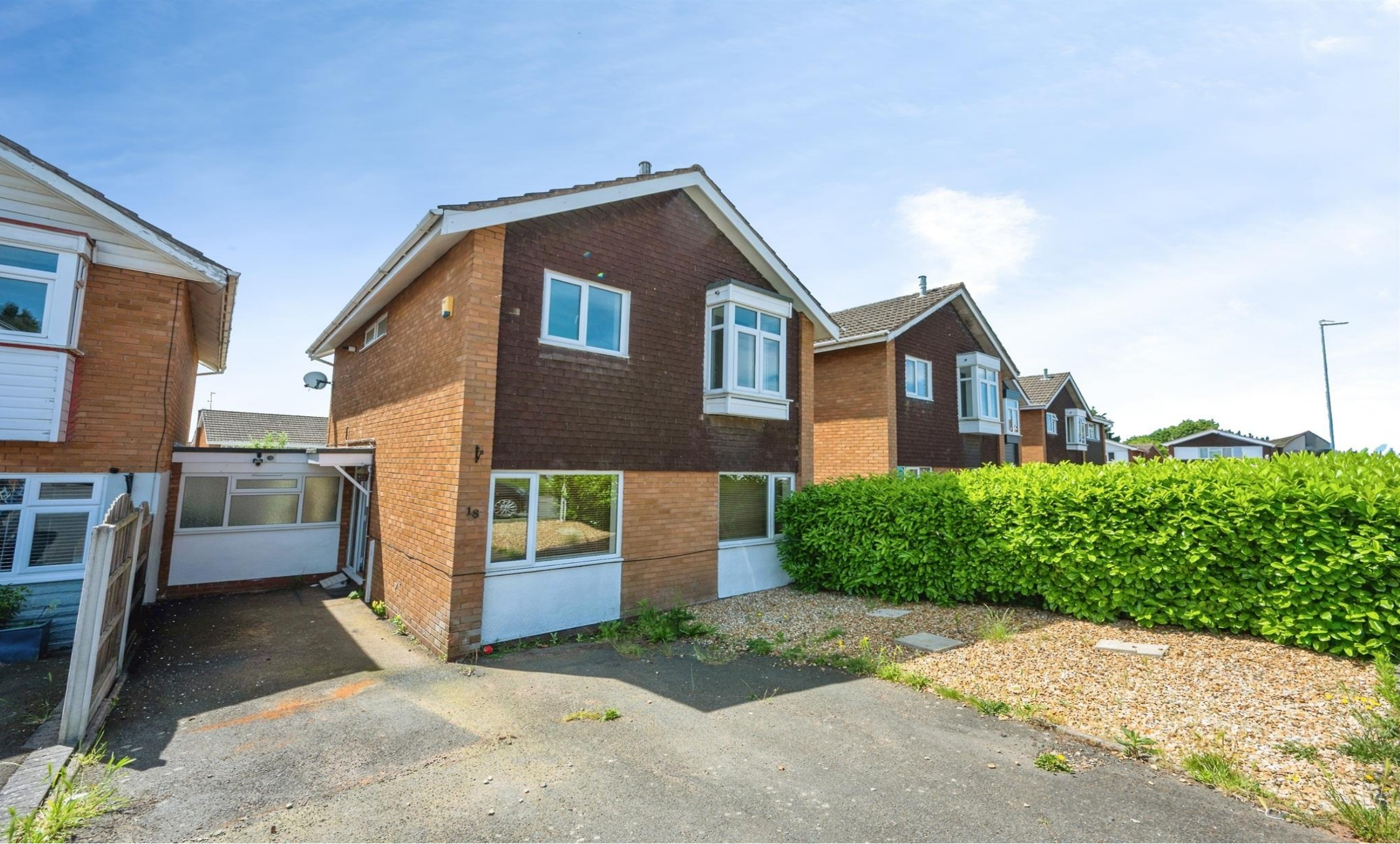
Osborne Close, KIDDERMINSTER DY10 3YY