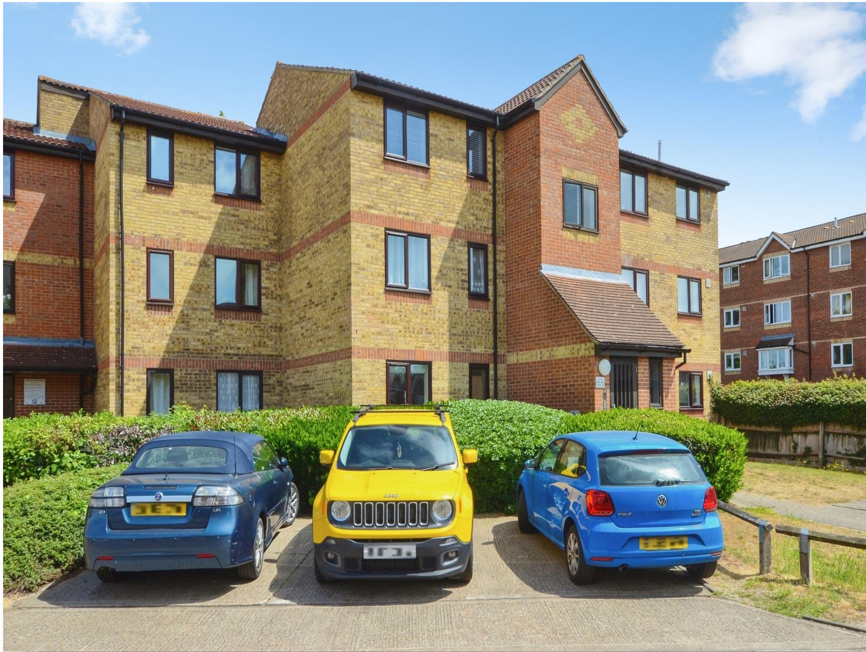
Arran House, Pioneer Way, Watford, WD18 6SU