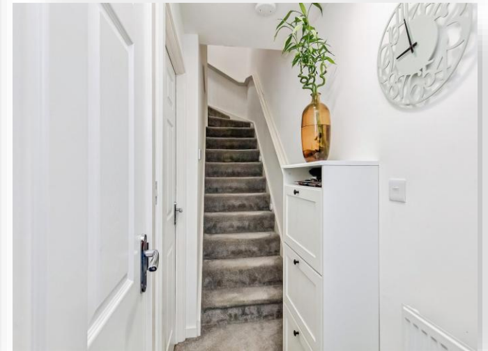
Trout Close, Weldon Corby NN17 3FY