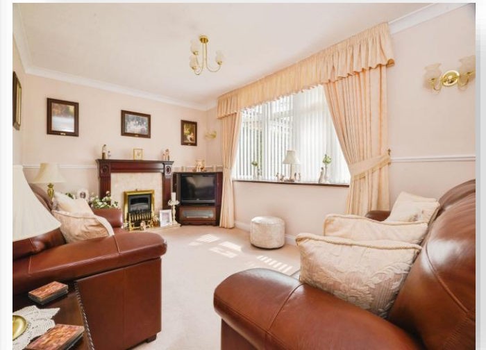
Cabot Court, Thornaby Stockton-On-Tees TS17 0DJ