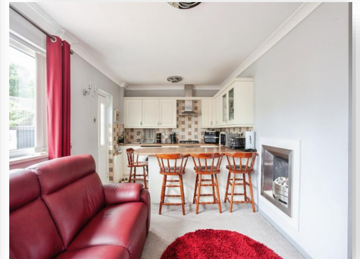
Lindley Crescent, Thurnscoe Rotherham S63 0SW