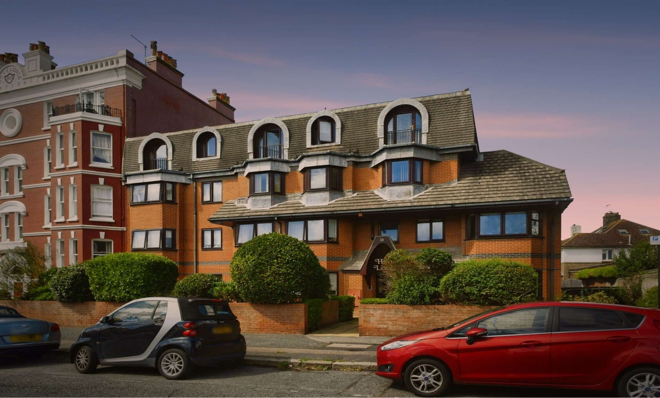
Hove Lodge Hove Street, Hove BN3 2TS