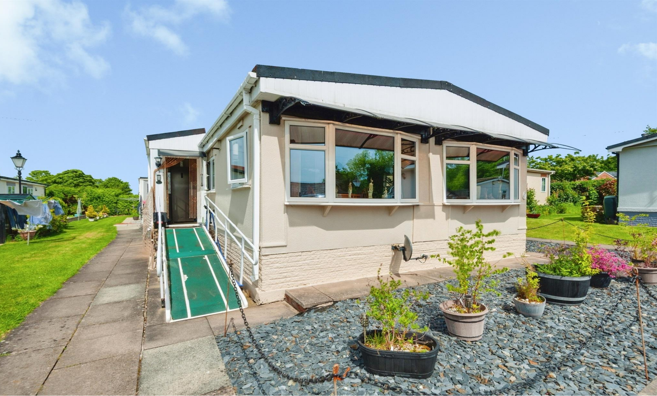
Woodhouses Park Chester Road, Frodsham WA6 6XP